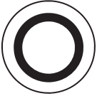
Bonded Seal for British Thread